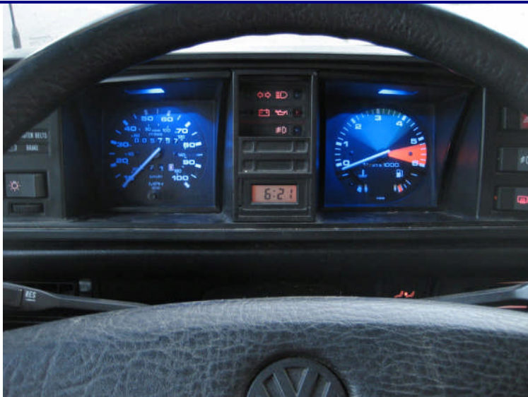
Member: vanshock Speedo & Tach: Blue LED Warning lights, clock, switches: Red LED