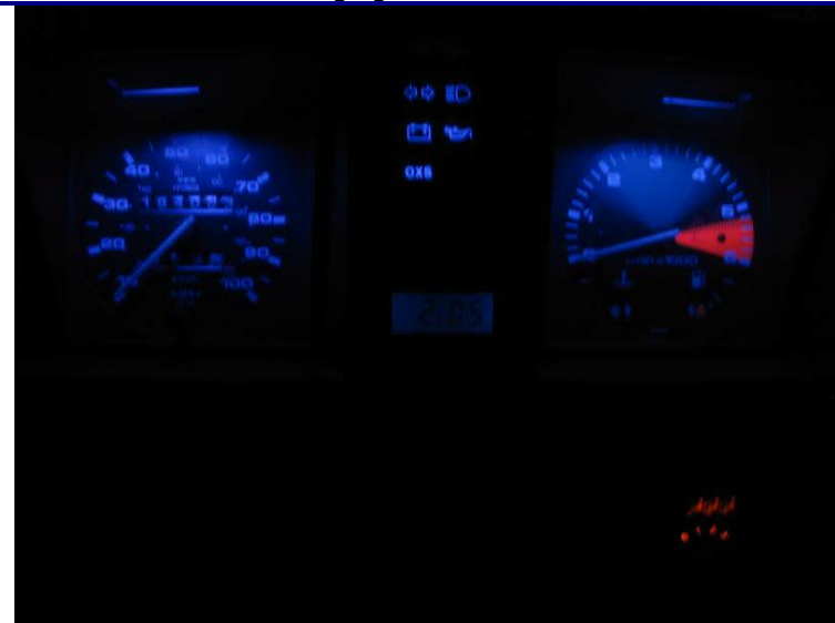
Member: ahollon Speedo, tach, warning lights, clock: Blue LED Switch: Red LED