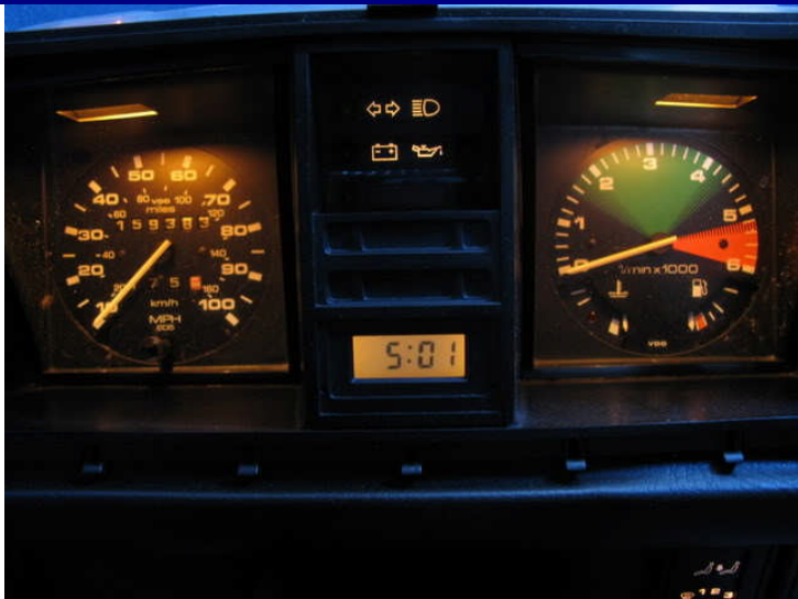
Member: kamzcab86 Speedo, tach, clock, warning lights: Original incandescent