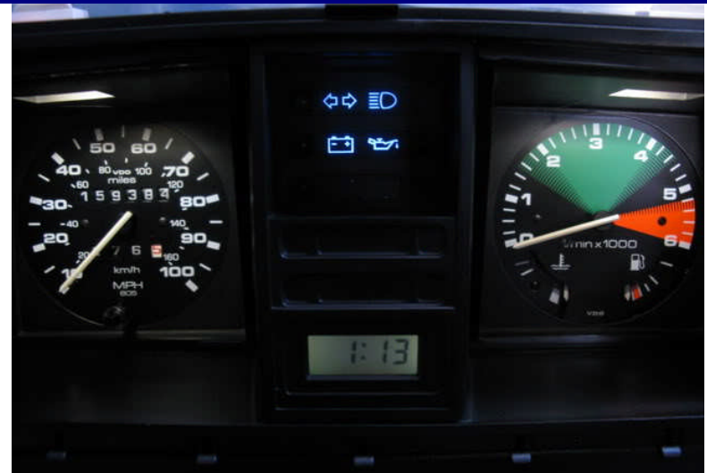
Member: kamzcab86 Speedo, tach, clock: White LED Warning lights: HP Blue LED