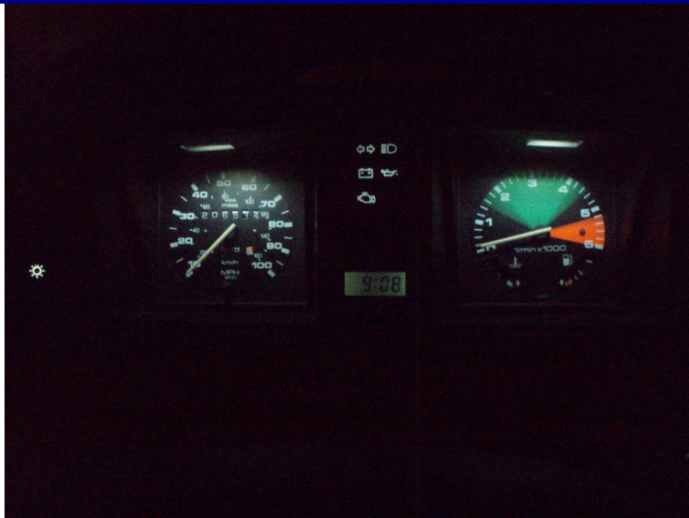
Member: syncrodoka Speedo, tach, warning lights, clock, switch: White LED