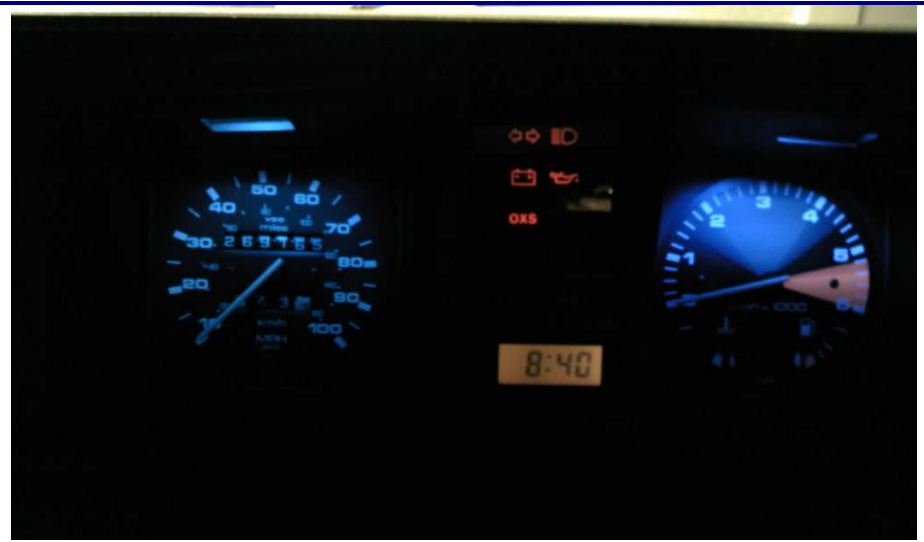
Member: keithwwalker Speedo & tach: Blue LED Warning lights: Red LED Clock: White LED