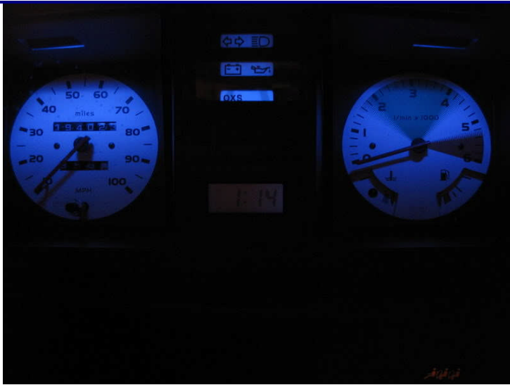
Member: ahollon Speedo, tach, warning lights, clock: Blue LED White gauge faces installed.